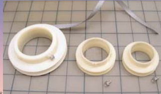
New Roller Roman Spools