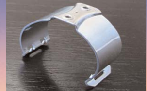
New Roller Roman Lift-Line Clips