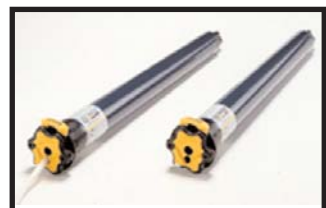
Motorized Roller Romans

The new RollEase Roller Roman-Shade Lift-Line Spools or Clips allow workrooms to easily fabricate a Roller Roman Shade with the most complete and reliable clutch systems in the industry. RollEase's award winning lift systems are specified by Interior Designers, Architects, and Workrooms worldwide. RollEase is considered the finest manually operated lift systems available and are used 3-to-1* over the competition.